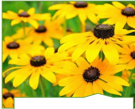
Black Eyed Susan