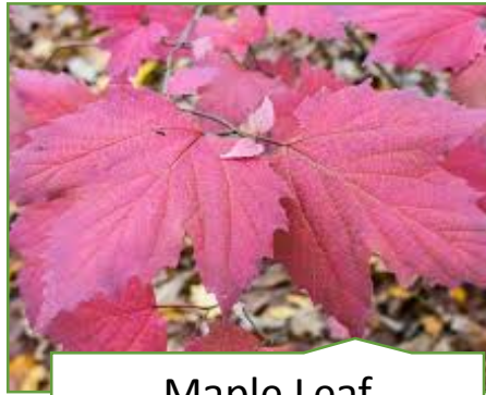
Maple Leaf Viburnum