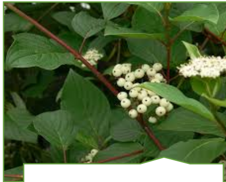
Red Osier Dogwood