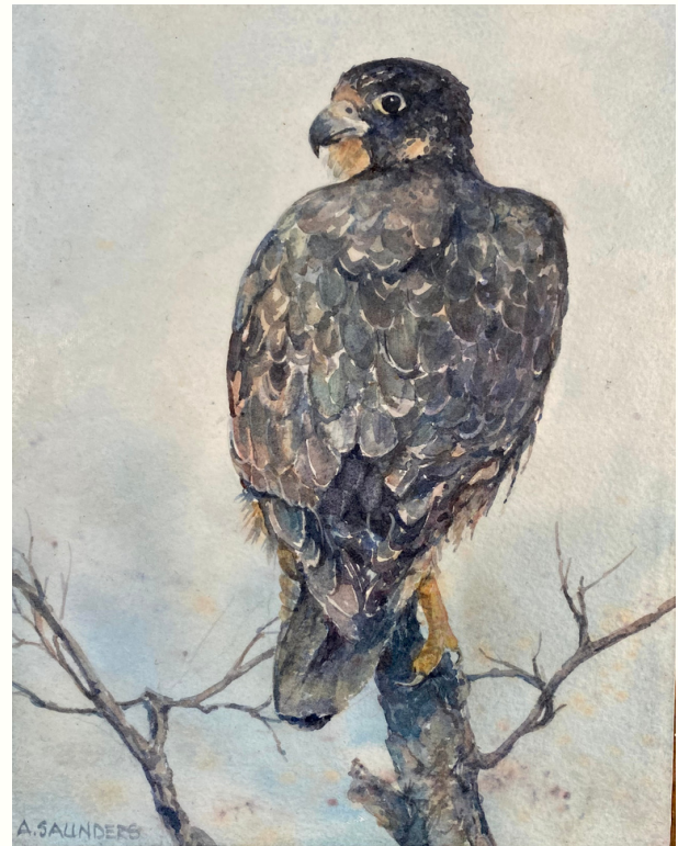
PEREGRINE FALCON BY ARLENE SAUNDERS

Your support can help us make a difference! Here is a short story to illustrate - Following a visit to the Grade 3-4 classroom, one of the students recognized me at the local grocery store, and intentionally followed me to initiate a conversation about birds, "Guess what we saw at school this week? About 100 Bohemian Waxwings! They were beautiful!" That made my day - the fact that the student was excited about birds and wanted to share their observation with me, told me they were smitten with the love for birds. They already see nature's beauty and understand the importance of protecting it.