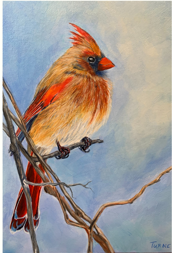
PRETTY LADY BY FRAN TURNER

The popular fundraiser is back for 2023, showcasing local Saugeen (Bruce) Peninsula talent for a good cause